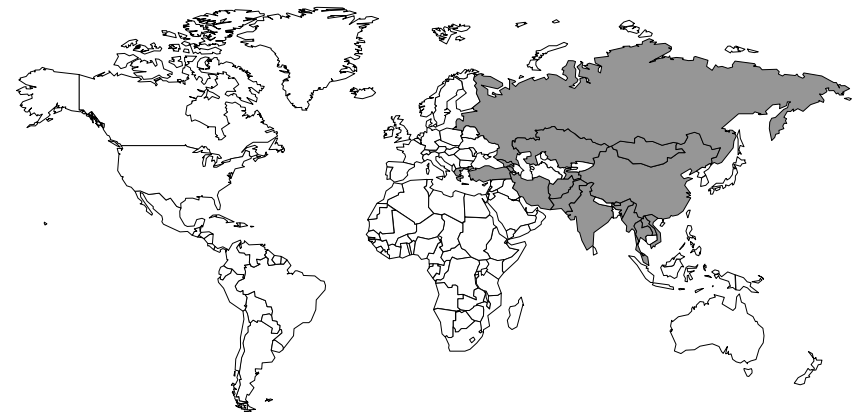
FMDV Asia 1

(hashed areas indicated unconfirmed reports)